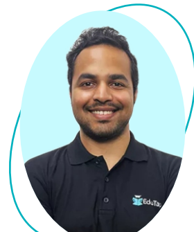
Devanshu Sir Current Affairs Expert