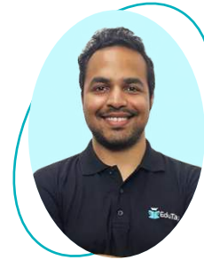
Devanshu Sir Current Affairs Expert