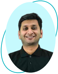
Anchit Sir Super Mentor

Fast-track your success with the SEBI Legal Dream Team. Get the best faculty to maximize your preparation and ensure you crack the exam as quickly as possible.