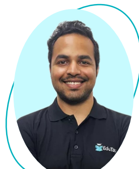
Devanshu Sir Current Affairs Expert