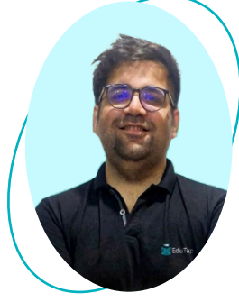
Jalaj Sir FM Expert