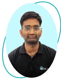
Surender Sir General Science Expert