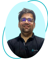
Jalaj Sir FM Expert ★★★★★