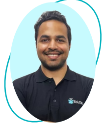
Devanshu Sir Current Affairs Expert ★★★★★