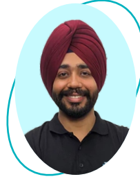
Gurkirat Sir Current Affairs Expert ★★★★★