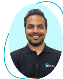
Devanshu Sir Current Affairs Expert